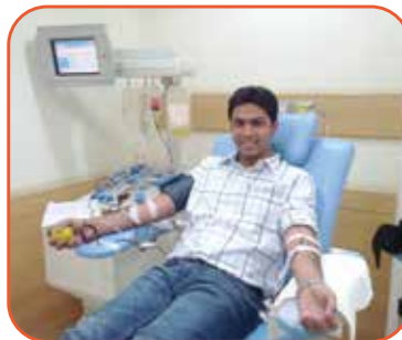
Blood Stem Cell Collection