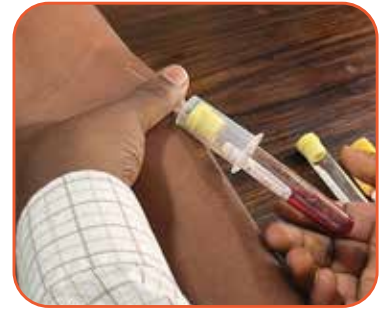
Infectious disease markers & Verification testing.