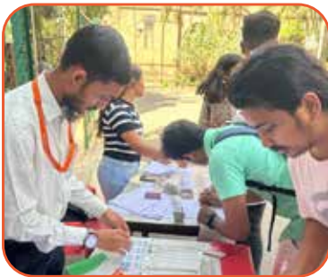
Donor recruitment drive

As a non-governmental organization (NGO) that operates without government funding, DATRI relies heavily on individual donations and corporate social responsibility (CSR) contributions to sustain our operations. Despite our best efforts, the rising costs of stem cell donation and transplantation have placed significant strain on our resources. This is where we need your continued support to help us maintain our life-saving mission.