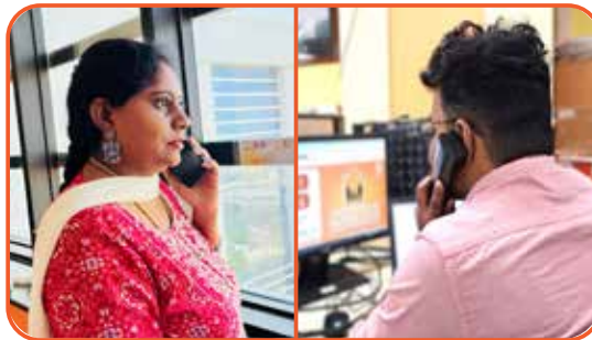
Counselling - the donor