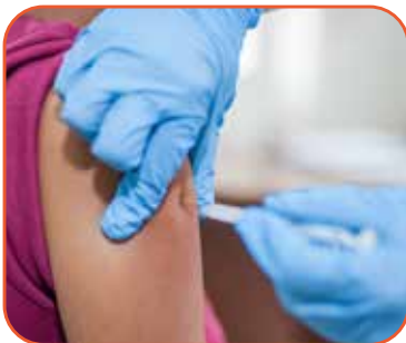
GCSF injections for mobilization