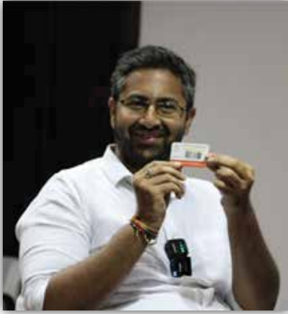
Sribharat Mathukulili, Member of Parliament

The event's chief guest, Sribharat Mathukulili, Member of Parliament , expressed his joy in witnessing such a beautiful moment of recovery from life-threatening blood cancer, commending DATRI's crucial role in saving lives. He highlighted the urgent need for greater awareness about blood stem cell donation and urged more individuals to register as donors.