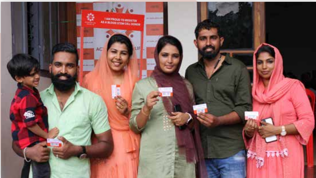
DONOR REGISTRATION DRIVE

But with COVID cases going down and restrictions being eased, we are now actively conducting recruitment drives across the country. In the last one year, we have achieved a milestone by crossing 1,000 donations. Today, we are back on our toes and our recruitment drives are in full swing. We are scouting and looking forward to partner with other organizations for recruitment drives.