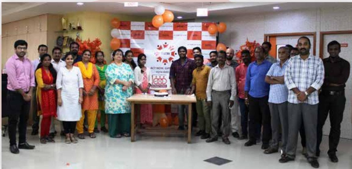
Celebrating 1000 donations

A thousand donations are an inspiration for us, and, at the same time, it encourages us to go further for we know that there are thousands of recipients waiting for their match and we hold the key to bring back that zing in their lives. At this juncture we are reminded aptly of a line from T S Eliot's poem The Waste Land, "Hurry up please, its time"!